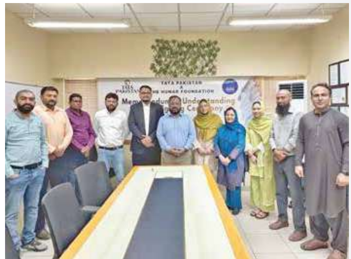
THF x Tata Pakistan

The Hunar Foundation (THF) signed a Memorandum of Understanding with HR Dost to redefine career pathways for students and alumni by connecting them with top HR professionals and industry leaders. Key initiatives include the THF - Rehbar mentorship program with 10 -15 senior HR leaders, HR meetups at THF's corporate office, on-campus guidance, industry visits, and strengthened job placement support. By combining mentorship, industry exposure, and HR expertise, this collaboration enhances employability and nurtures a skilled, confident, workforce-ready generation driving Pakistan's socio-economic growth.