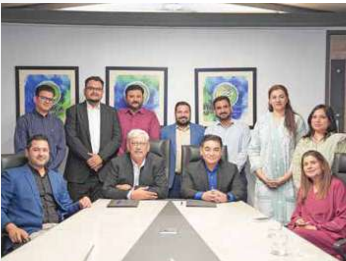
THF x HR Dost

The Hunar Foundation (THF) signed a Memorandum of Understanding with HR Dost to redefine career pathways for students and alumni by connecting them with top HR professionals and industry leaders. Key initiatives include the THF - Rehbar mentorship program with 10 -15 senior HR leaders, HR meetups at THF's corporate office, on-campus guidance, industry visits, and strengthened job placement support. By combining mentorship, industry exposure, and HR expertise, this collaboration enhances employability and nurtures a skilled, confident, workforce-ready generation driving Pakistan's socio-economic growth.